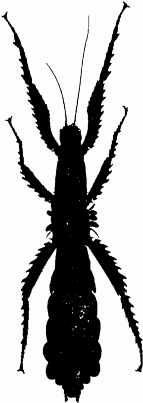
Fig. 1. Cotyllosoma dipneusticum W.-M., ♀.

In 1878 WATERHOUSE showed WOOD-MASON a Phasmid in the British Museum collection with curious laminate appendages on the